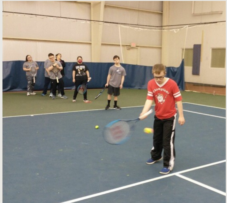
BuddyUp Tennis Fall Session

We delivered gift cards to families staying at UPMC Children's and St. Clair Hospital.